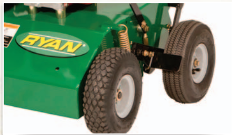
Self-propelled unit makes for easy operation and consistent ground speed.

Specifications subject to change without notice.