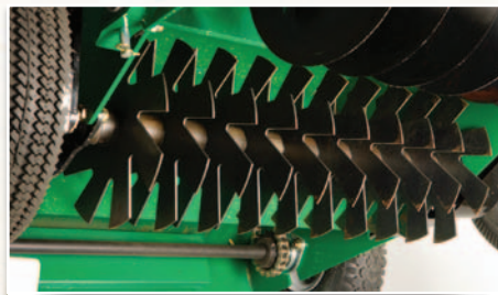
Durable cutting blades can be adjusted down to a depth of 1/2".